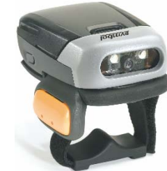
RS507-IM20000STWR Imager with trigger and standard capacity battery