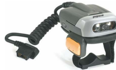
RS507-IM20000CTWR Corded imager with trigger