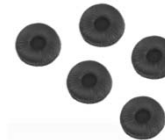
KT-126574-01R Replacement ear pads foam, (5 pk)