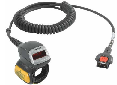
RS419-HP2000FLR Ring scanner with cable to waist