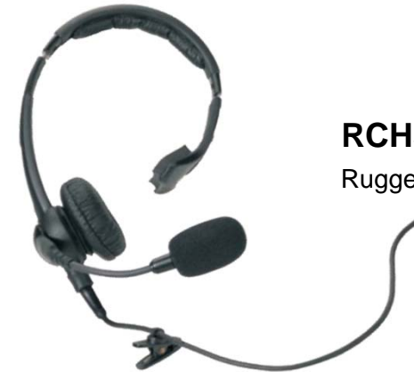
RCH51 Rugged cabled headset