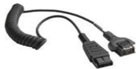
25-114186-03R Adapter cable with a coiled section for WT41N0