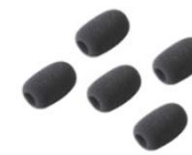
KT-126579-01R Replacement windsocks (5 pk)