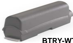
BTRY-WT40IAB0H Extended Lithium Ion battery, 4600 mAh