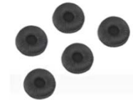
KT-126580-01R Replacement earpads leatherette (5 pk)