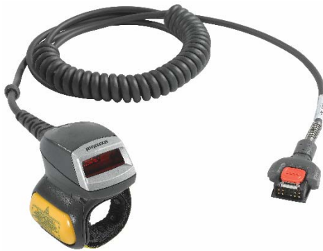
RS419-HP2000FLR Ring scanner for WT41 hip mounted.