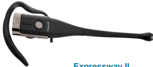
Expressway II Bluetooth Headset for WT41N0