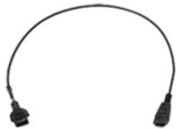
25-124412-02R Long adapter cable (19") for WT41N0 (hip mounted)