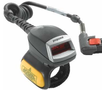
RS419-HP2000FSR Ring scanner for WT41 wrist mounted.